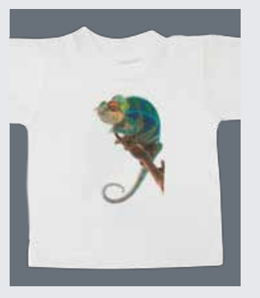
Produced with: TECHNI-PRINT<sup>®</sup> EZP Paper